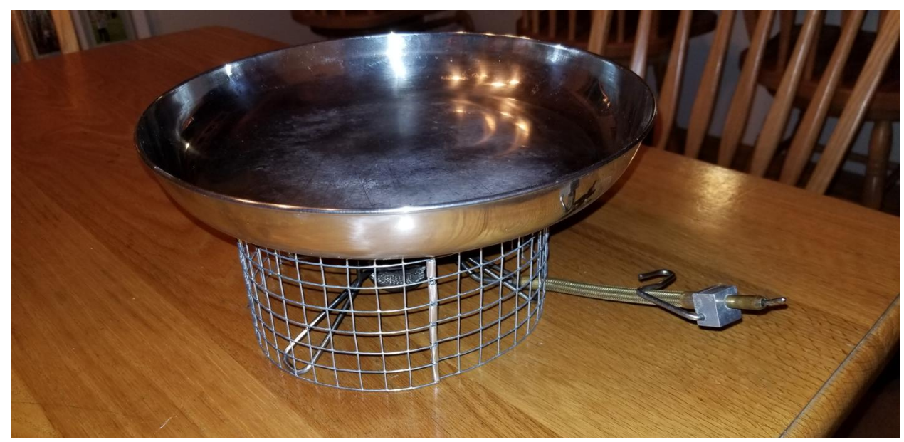
Fig. 1: Whisperlite stove and 1/2" x 1/2" hardware cloth pot support shown without windscreen

One of the main problems cooking with most backpacking stoves is the small base upon which the pot sets. If you are not careful, supper can slide off of the stove and spill on the ground. This is a real bummer at the end of a long hard day of hiking. You can reduce this problem with extra support for the pot with a pot stand cut out of 1/2" x 1/2" hardware cloth (Fig. 1). Hardware cloth is strong enough to support a pot, but weighs next to nothing.