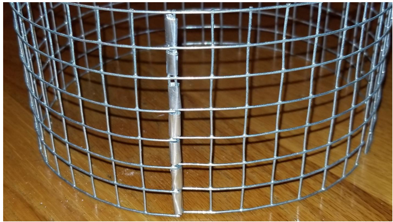
Fig. 2: Aluminum strips wrapped tightly around the ends makes a strong hinge.

With the wire cutters, cut a notch in the bottom of the pot stand to allow the Whisperlite stove fuel line to pass through (Fig. 3 and Fig. 4).