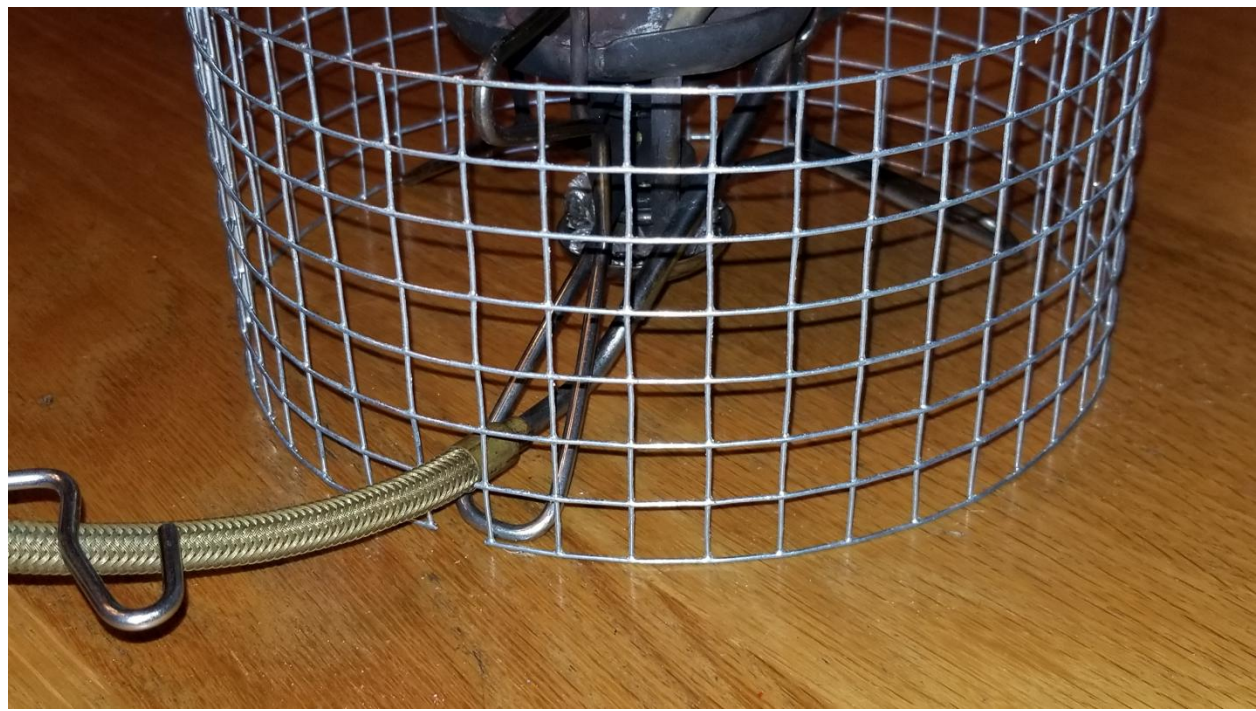
Fig. 4: Whisperlite fuel line passing through the notch in the pot stand.